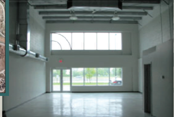
View from the back looking forward before hardwood flooring installed