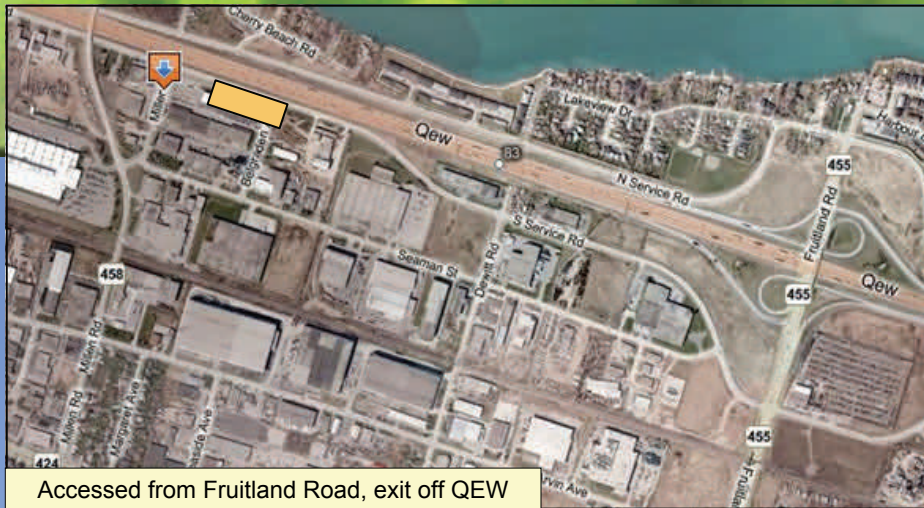
Accessed from Fruitland Road, exit off QEW