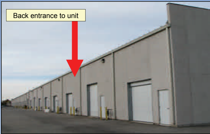
Back entrance to unit